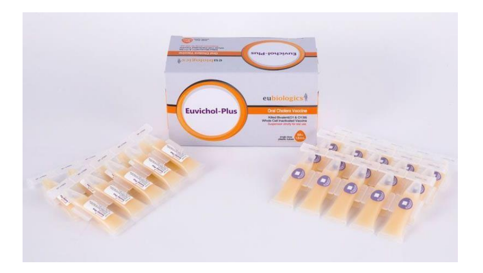
Figure 2: Euvichol-Plus®