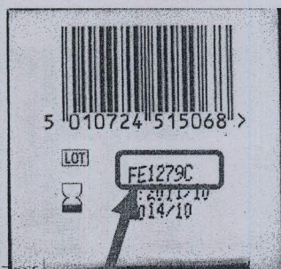
Location of batch code on carton

Consumer health and safety is of utmost importance to Church & Dwight UK Ltd