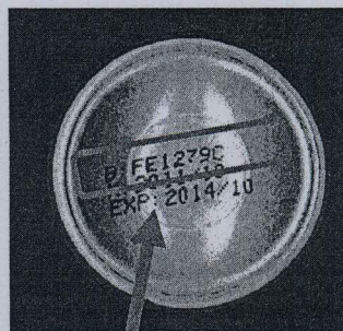
Location of batch code on base of can