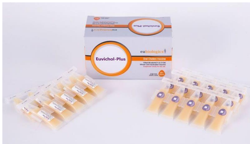
Figure 2: Euvichol-Plus®