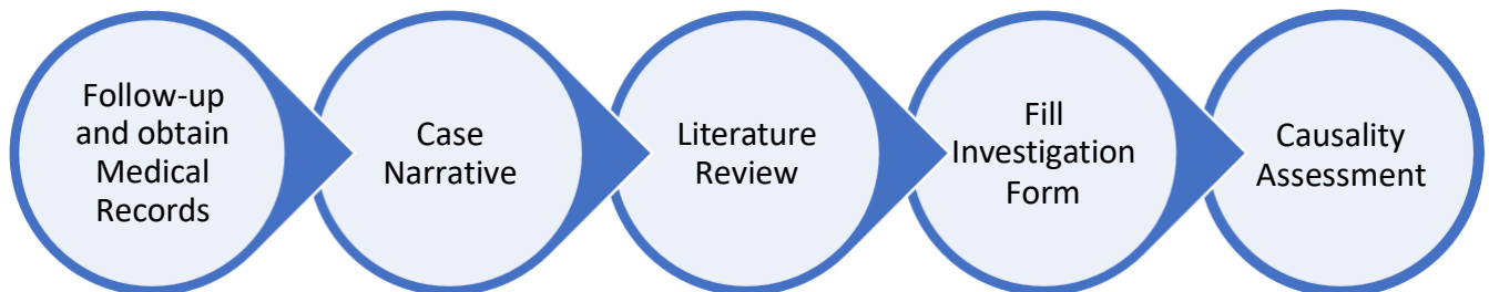
Figure 3: Handling of serious case reports in the context of Oral Cholera Vaccines

The serious case reports undergo a longer process before they are entered into the central database (Figure 3).