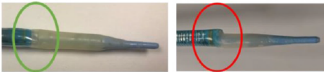
Figure 1. Examples of expected smooth (left) and dislodged (right) fairing tip.