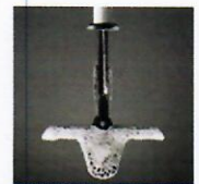
Clip Arms at 180°