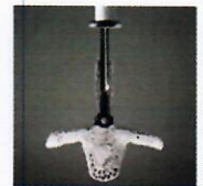
Clip Arms Inverted