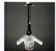
Clip Arms Fully Inverted