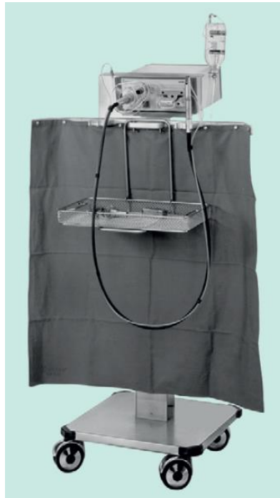
Figure 1: Disposable Fleece Drape GA414 attached to sterile shield GA419 on a mobile stand GA415 according to intended use

The scope of the affected articles can be limited to the Disposable Fleece Drape with the article number GA414. The Aesculap AG decided to recall the product as a precaution.