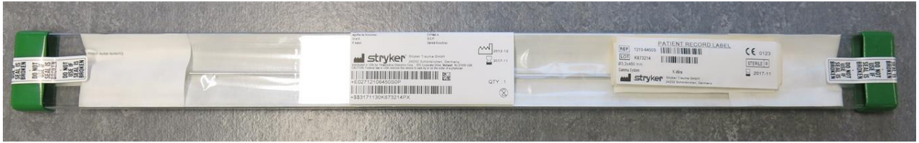
Packaging example – sterile pouch inside (plastic) clear tube