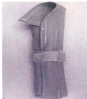
Figure 1: Wrap for Medullary Nails

Although the product is labeled for single use, customers may be reusing the canvas wrap to sterilize nails. Synthes GmbH has verified that a nail can be sterilized within the canvas wrap, but does not have sufficient testing for the device to be considered a multi-use item. The decision to recall was made to address the potential for multiple use of the wrap.